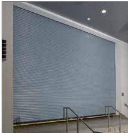
No. 4 slat

Secur-Vent® — Perforated slat provides optimal security and ventilation. Slat consists of 1/16" diameter holes offering 20-25% open area over length of each slat. Available in No. 14 flat slat up to 22' wide x 20' high (available in 20-gauge steel only).