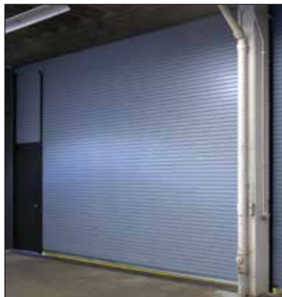
No. 14 slat, shown with a Pass Door