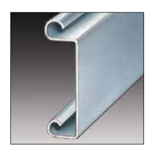
No. 17 – 2" Flat-faced slat up to 20-gauge steel, 20-gauge stainless steel, or 16 B&S gauge aluminum (mill, clear, or bronze anodized). Depth: 1/2", 1-7/8" on centers.