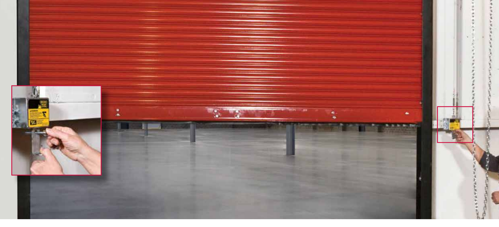
Test Device – FireStar<sup>®</sup> doors feature an easy-to-use release handle.